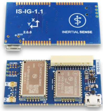
IG-2 SMT Module (GPX1 + IMX5) Size: 46.6 x 24.5 x 5.9 mm Weight: 8.5 g GNSS-INS: Multi-Band L1/L5

Development Kits available on our website.