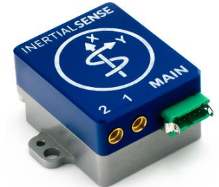
RUG-INS-5-RTK/Dual Size: 25.4 x 25.4 x 20.0 mm Weight: 14 g GNSS: Multi-Band L1/L2/E5