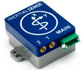
RUG-3-IMX-5-RTK/Dual Size: 30.5 x 25.4 x 14.8 mm Weight: 14 g GNSS: Multi-Band L1/L2/E5