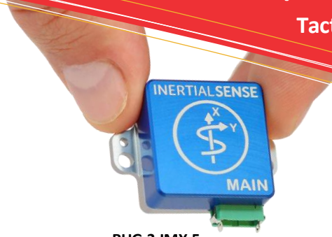
RUG-3-IMX-5 Size: 30.5 x 25.4 x 9.9 mm Weight: 10.5 g