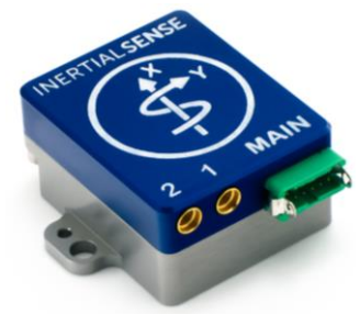
RUG-3-IMX-5-RTK/Dual Size: 30.5 x 25.4 x 14.8 mm Weight: 14 g GNSS: Multi-Band L1/L2/E5