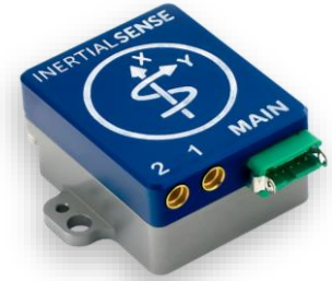
RUG4-IMX5-GPX1 Size: 30.5 x 25.4 x 10.5 mm Weight: 14 g GNSS-INS: Multi-Band L1/L5